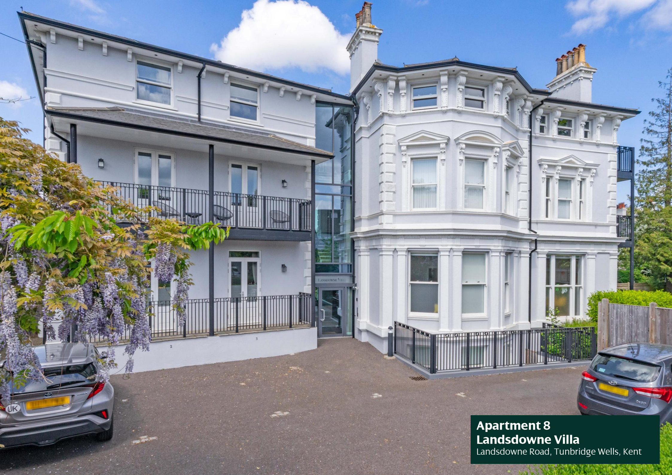
Apartment 8 Landsdowne Villa Landsdowne Road, Tunbridge Wells, Kent