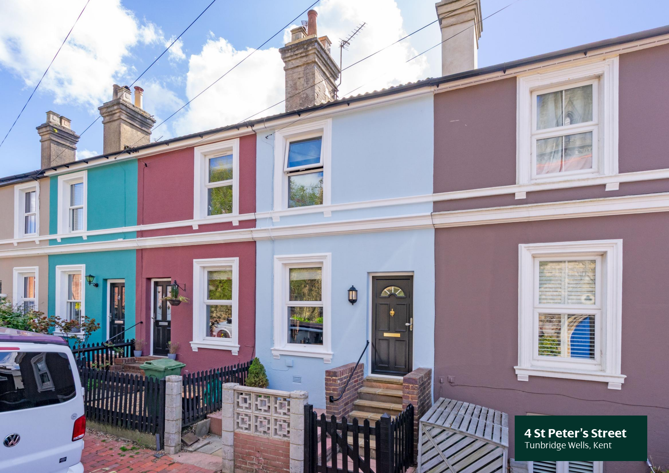
4 St Peter's Street Tunbridge Wells, Kent