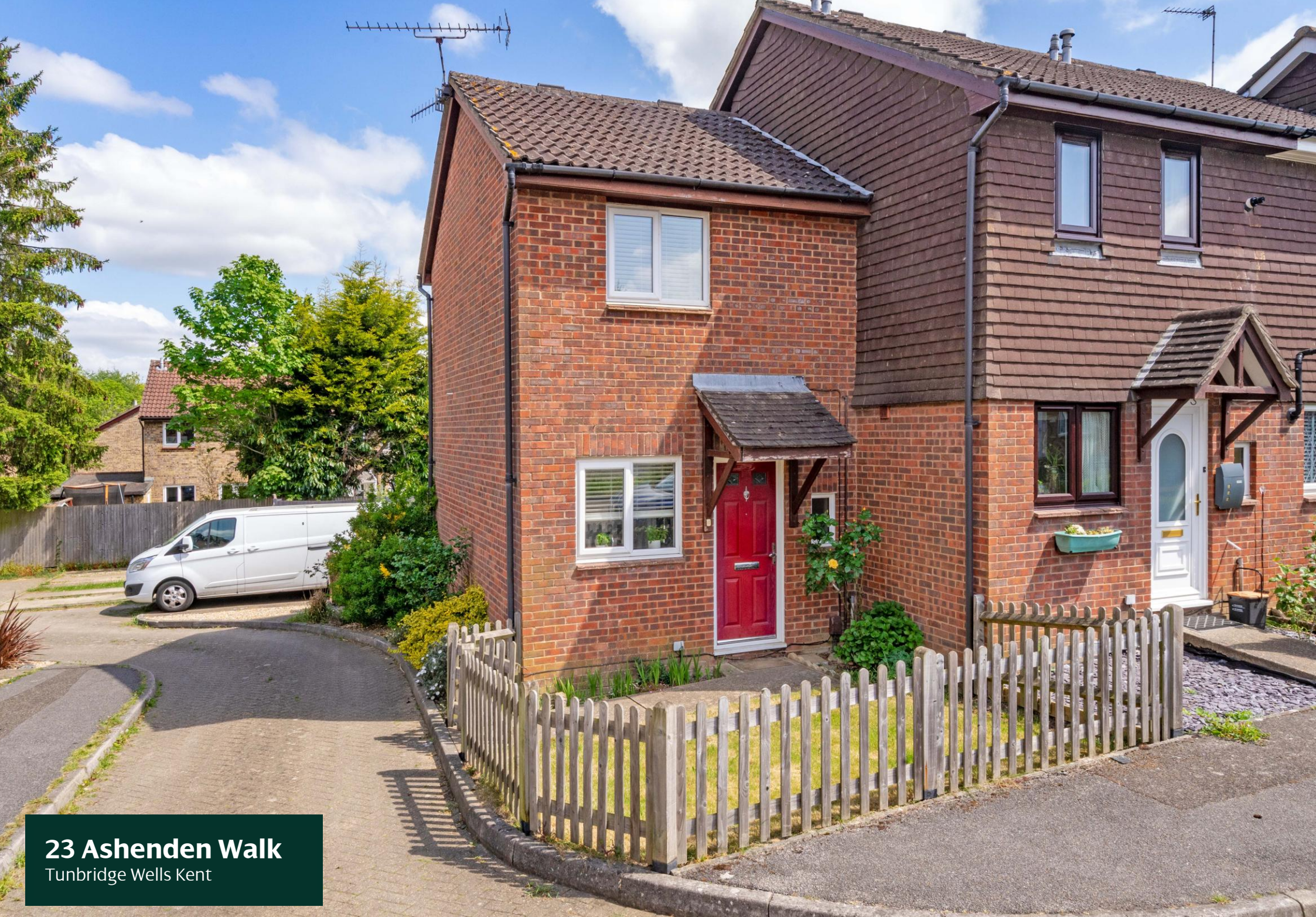
23 Ashenden Walk Tunbridge Wells Kent