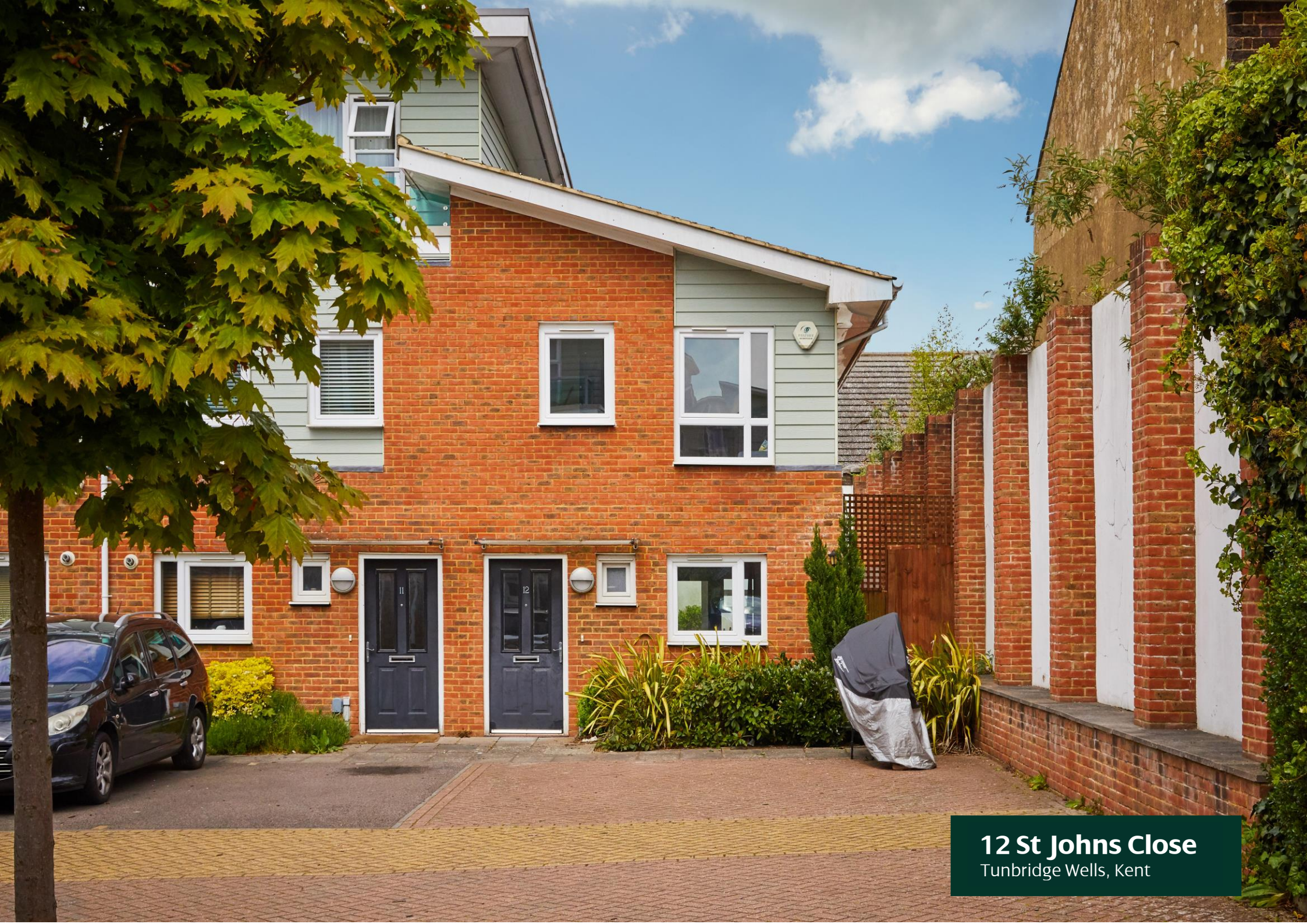
12 St Johns Close Tunbridge Wells, Kent