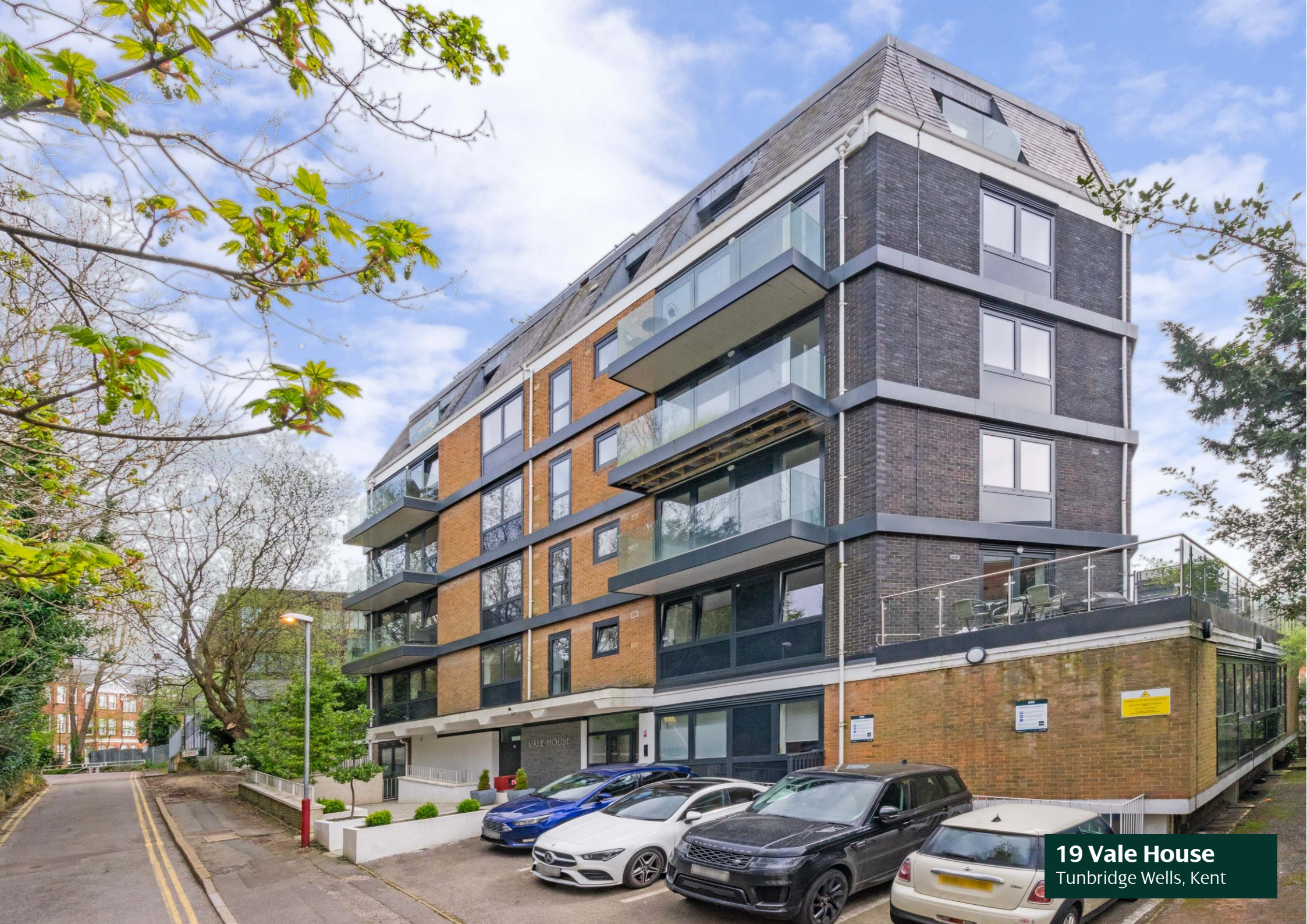
19 Vale House Tunbridge Wells, Kent