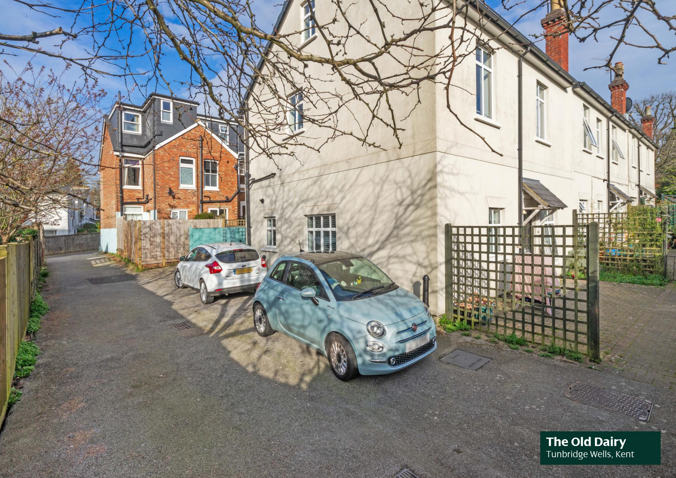
The Old Dairy Tunbridge Wells, Kent