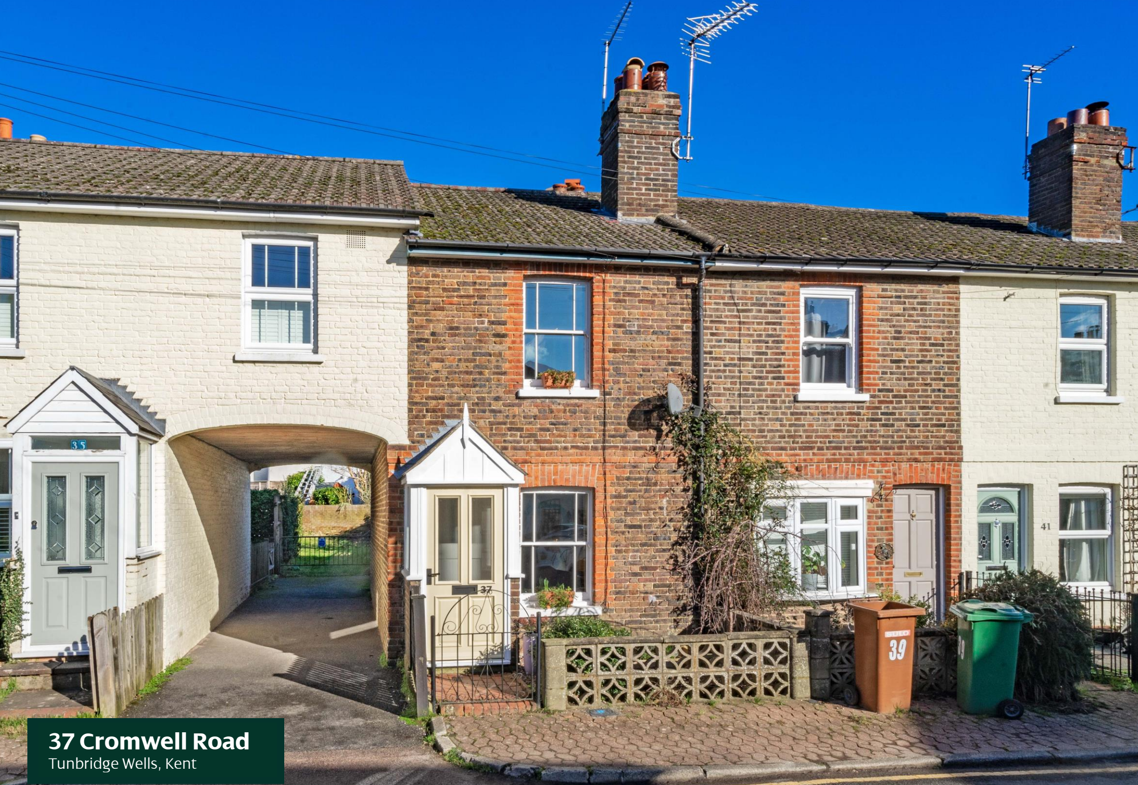
37 Cromwell Road Tunbridge Wells, Kent