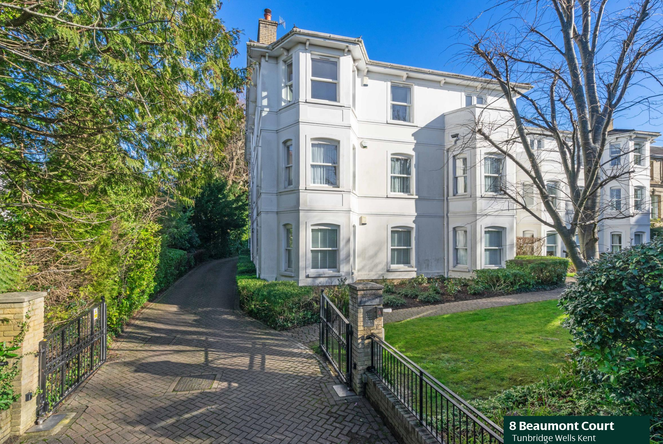
8 Beaumont Court Tunbridge Wells Kent