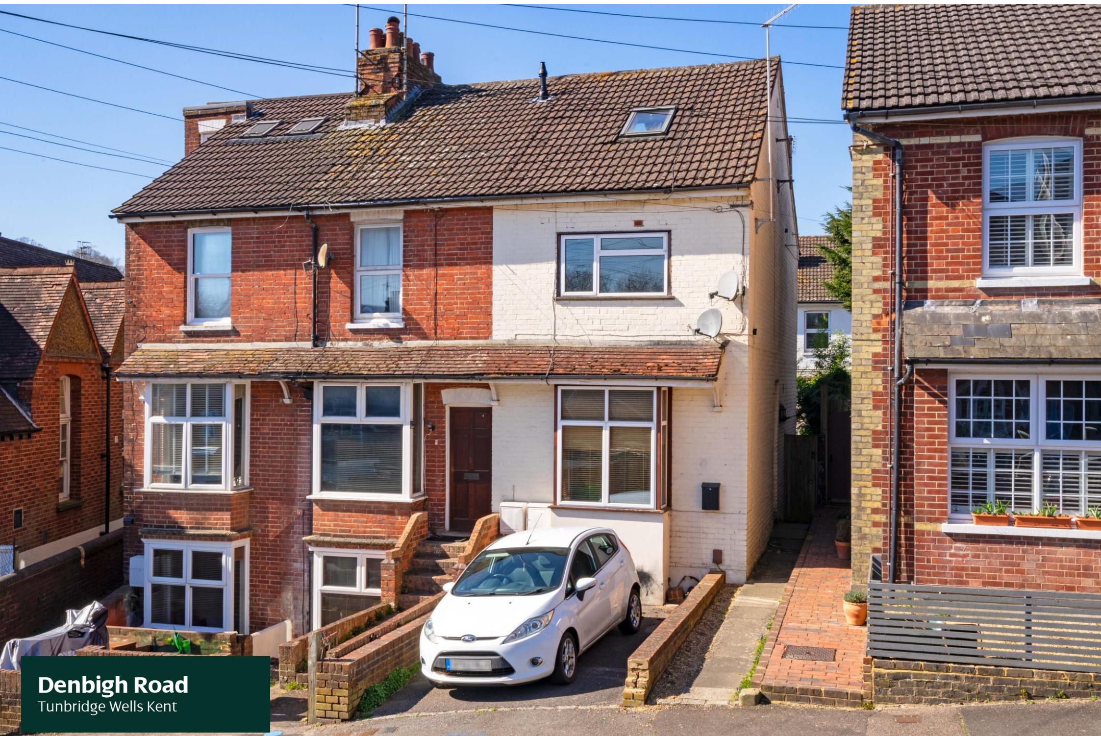
Denbigh Road Tunbridge Wells Kent