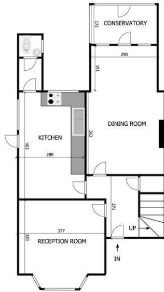
GROUND FLOOR 609.23 sq ft. approx.