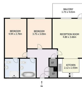
Craft Court, Bexleyheath, DA6 7BF