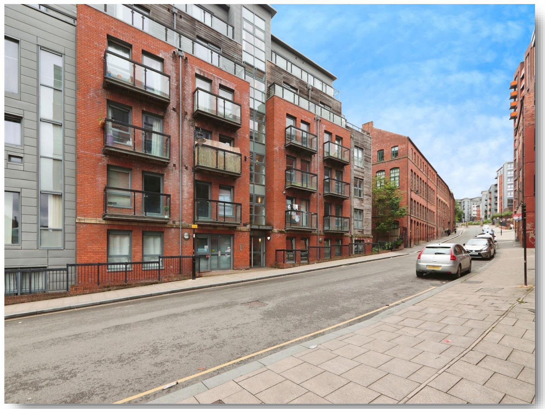
Q4 Upper Allen Street, Sheffield