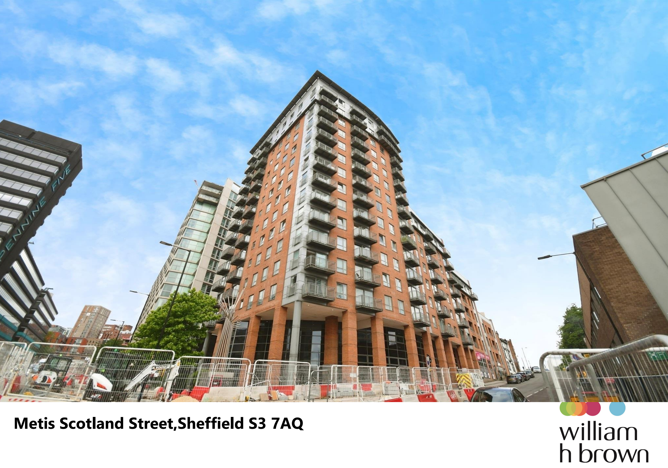
Metis Scotland Street, Sheffield S3 7AQ