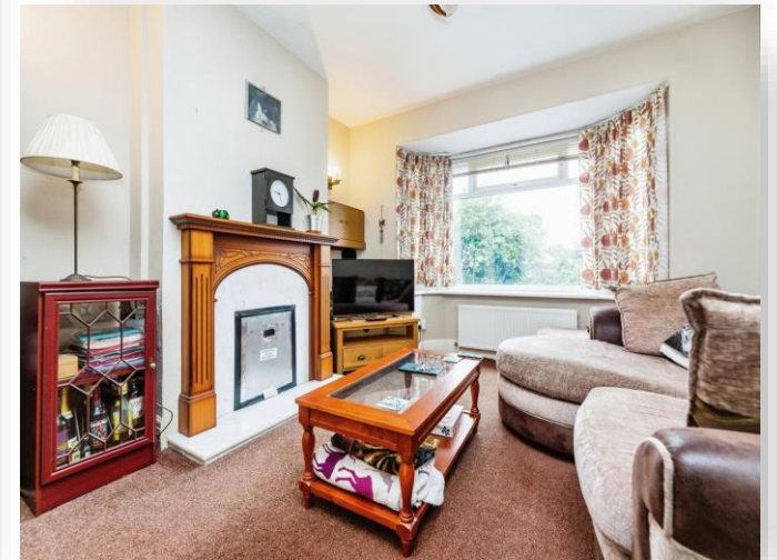
Farview Road, Sheffield