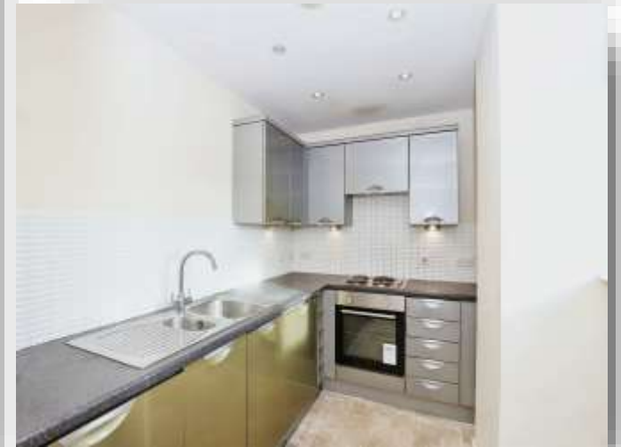
Anchor Point Bramall Lane, Sheffield