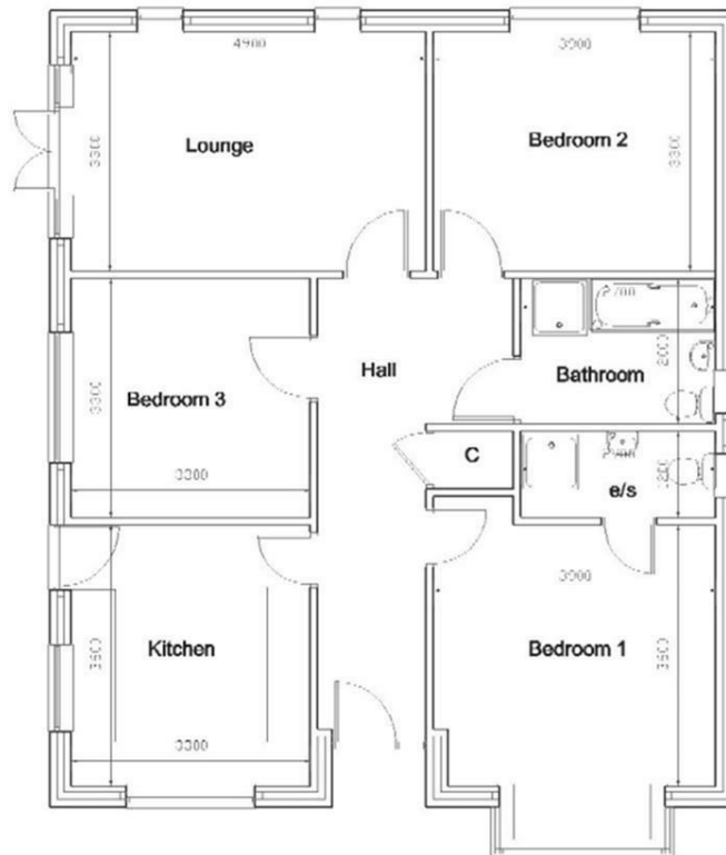
• GROUND FLOOR PLANS AS PROPOSED 1:50 •