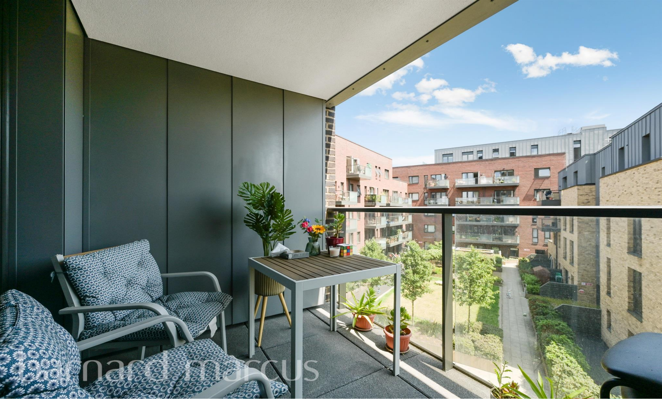
Leonard Court Meeting House Lane, London SE15 2BF