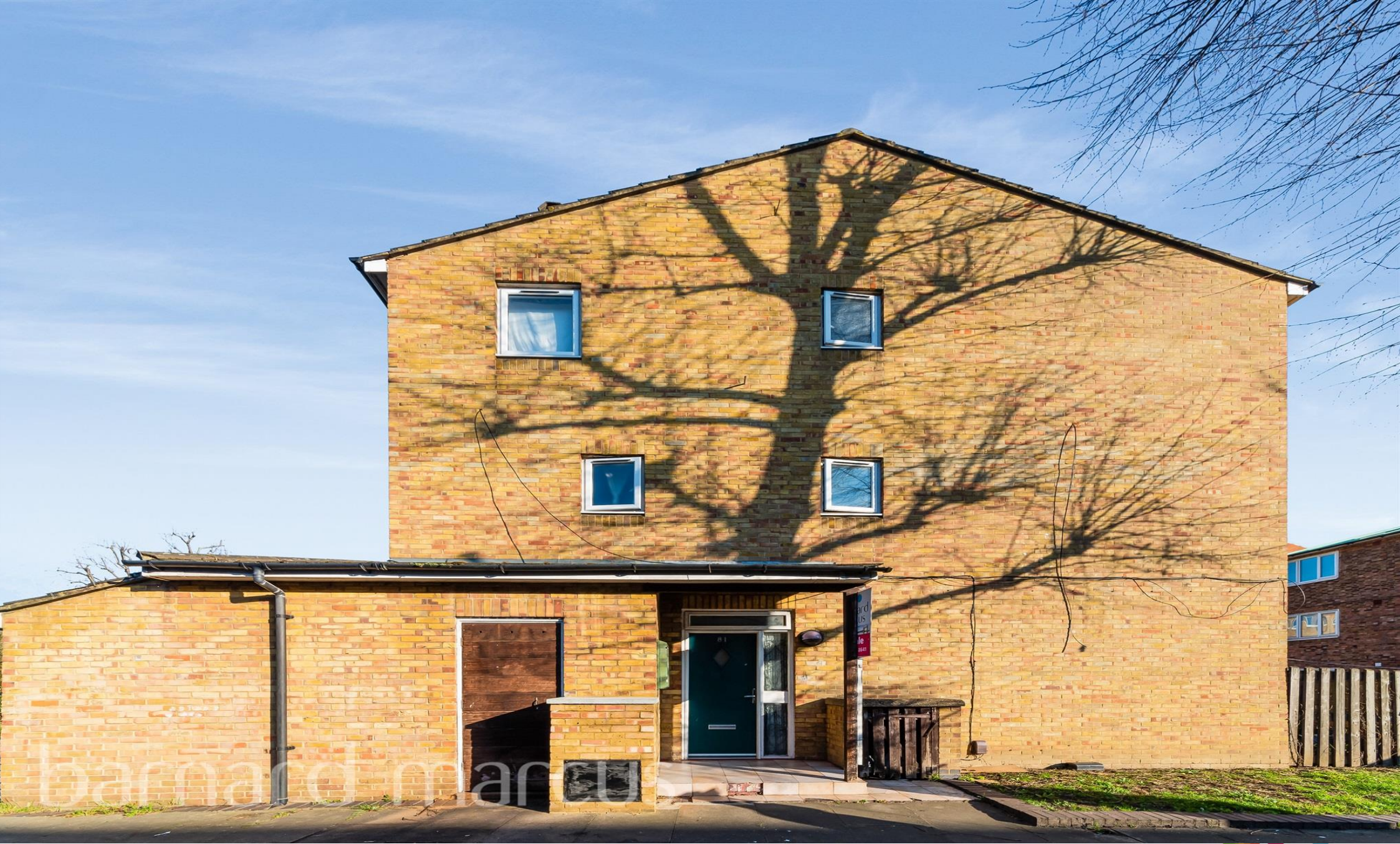
Montague Square, London SE15 2LR