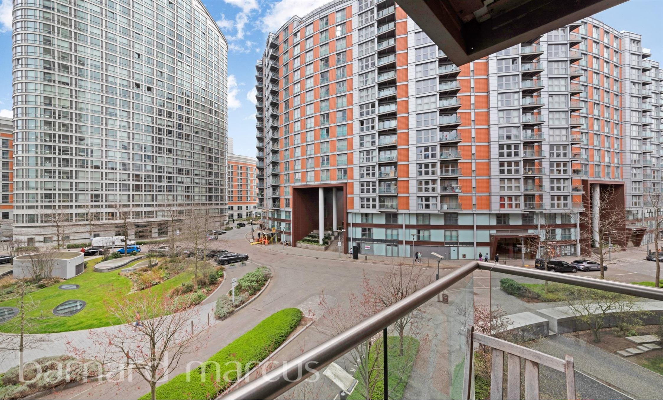
Michigan Building Biscayne Avenue, London E14 9QT