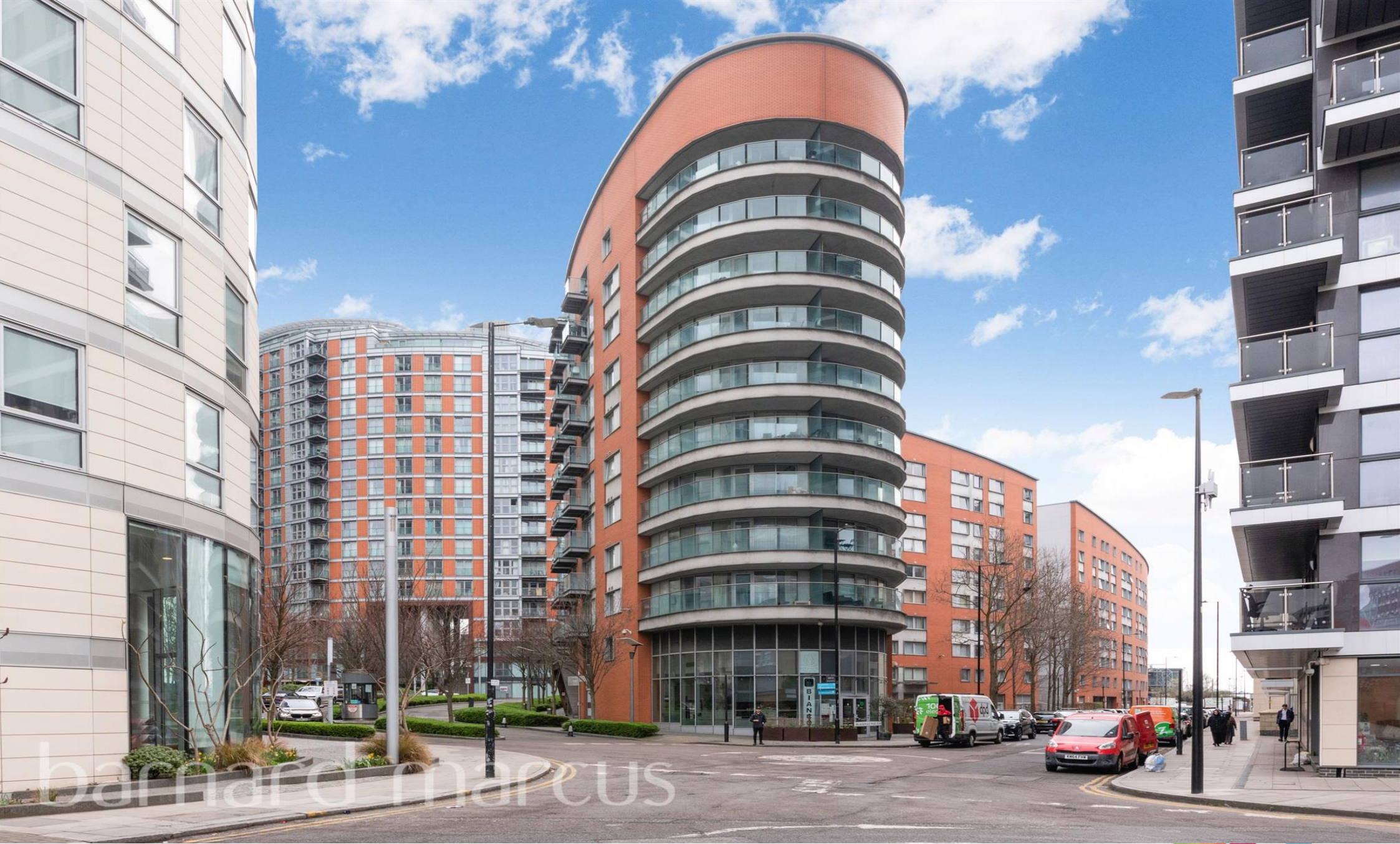
Michigan Building Biscayne Avenue, London E14 9QT