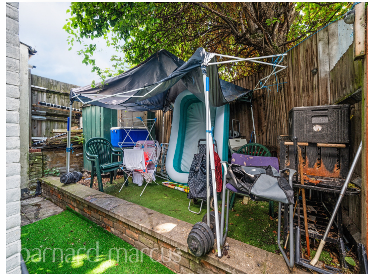
Ilderton Road, London SE15 1NS