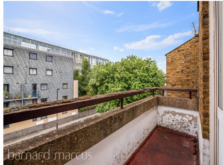
Yarnfield Square, London SE15 5JD