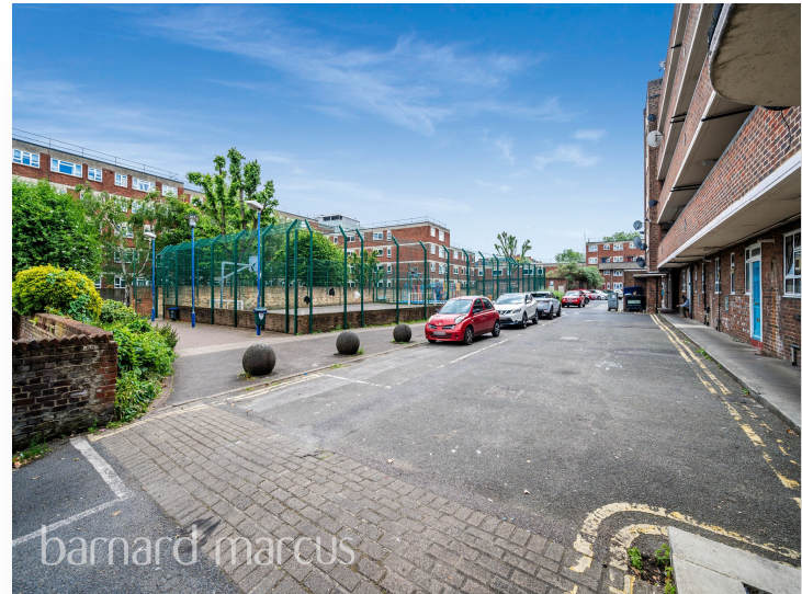
Landor House Elmington Estate, London SE5 7JE