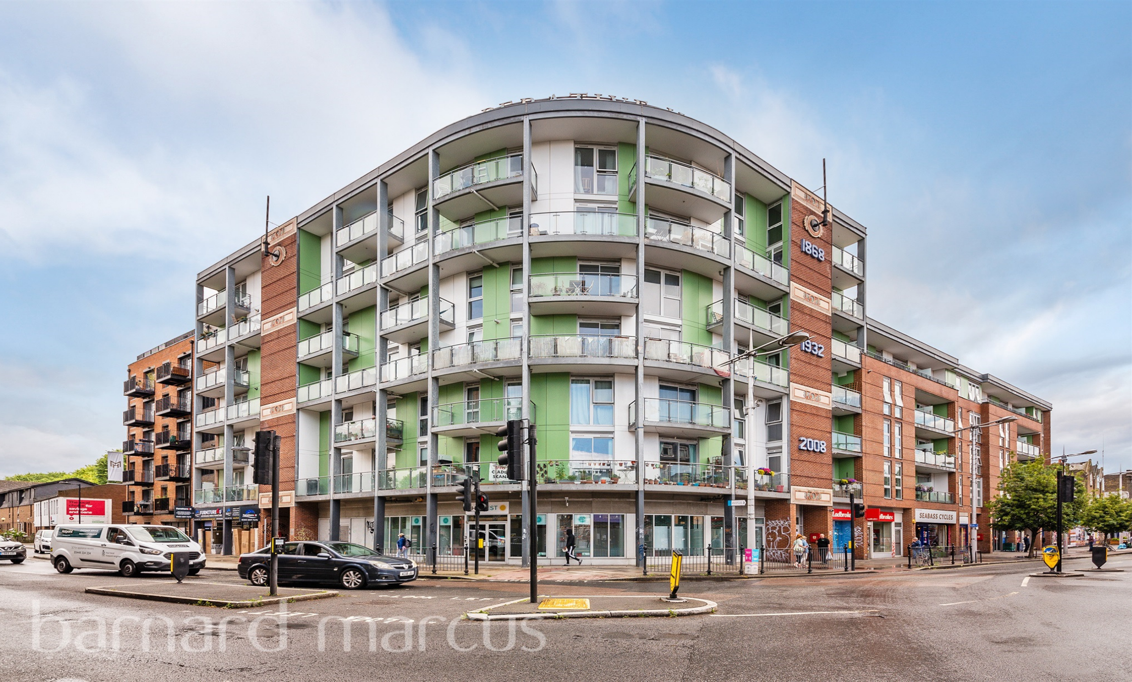
Co-Operative House Rye Lane, London SE15 4UR