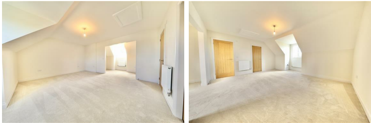
DRESSING AREA 11'3" max x 6'2" max (3.43m max x 1.88m max)