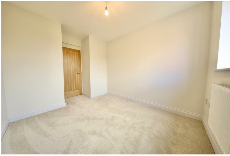
OFFICE 5'0" max x 7'10" max (1.52m max x 2.39m max)