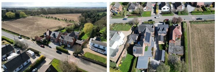
GARAGE A shared driveway leads beyond the property to a parking area