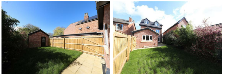
OUTSIDE The front garden is mainly laid to lawn with a gravelled driveway providing off-street parking. The rear garden is mainly laid to lawn with a paved patio area.