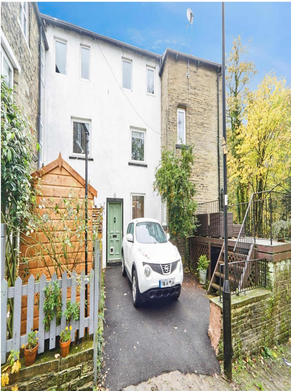
Ferrand Lane, Bingley BD16 2JP