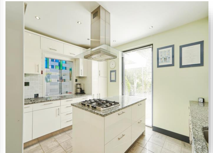
New Bungalow Beck Lane, Bingley BD16 4EL