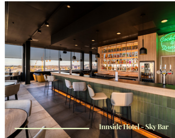
Inside Hotel - Sky Bar