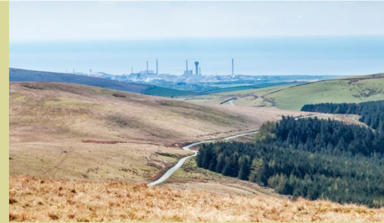
Grike Fell overlooking Sellafield

The property is accessed by the A595 which comprises a key arterial route servicing this region. Sellafield Power Station, one of Cumbria's most prominent employers, is situated just 4 miles to the North-West of the subject property.