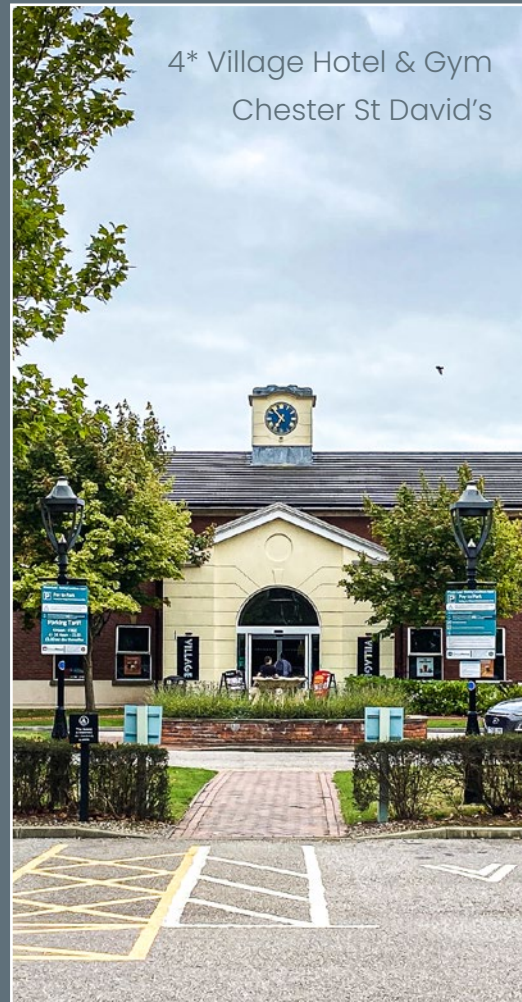
4* Village Hotel & Gym Chester St David's