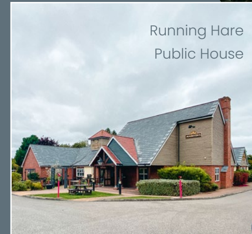
Running Hare Public House