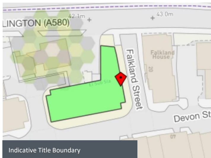
Indicative Title Boundary