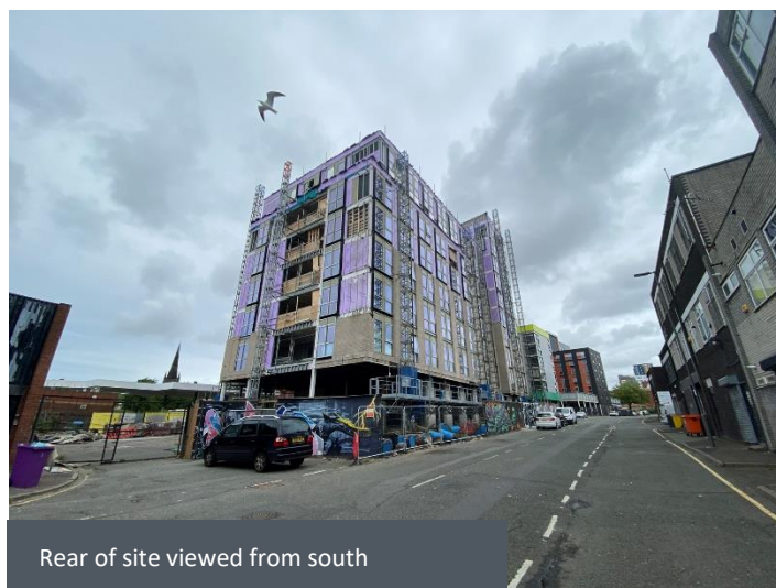
Rear of site viewed from south