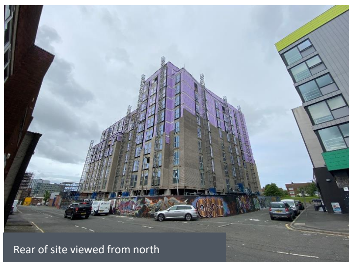
Rear of site viewed from north