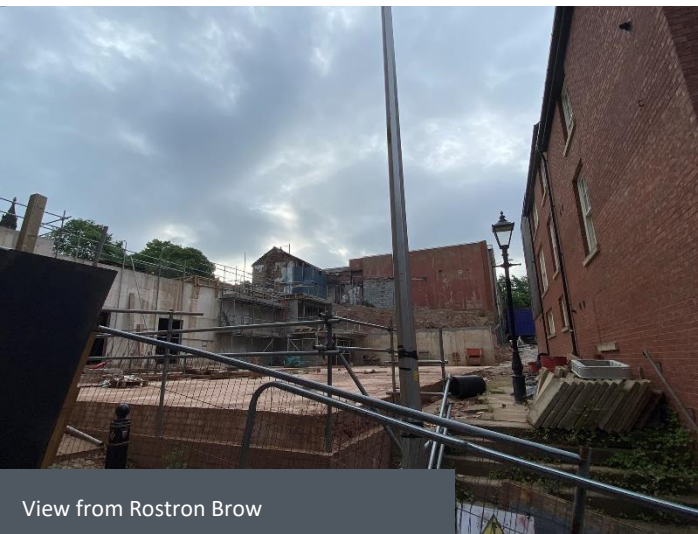
View from Rostron Brow