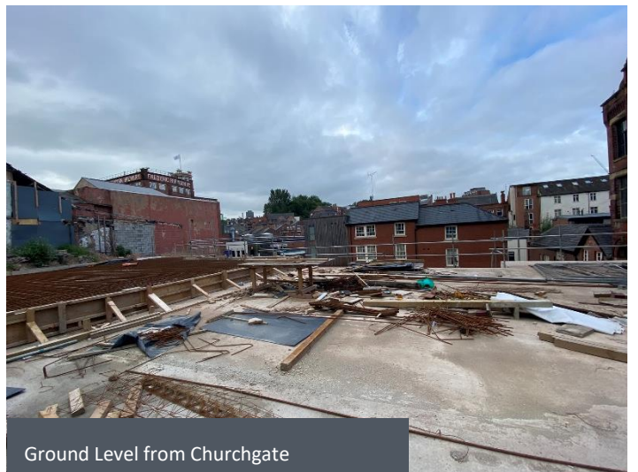
Ground Level from Churchgate