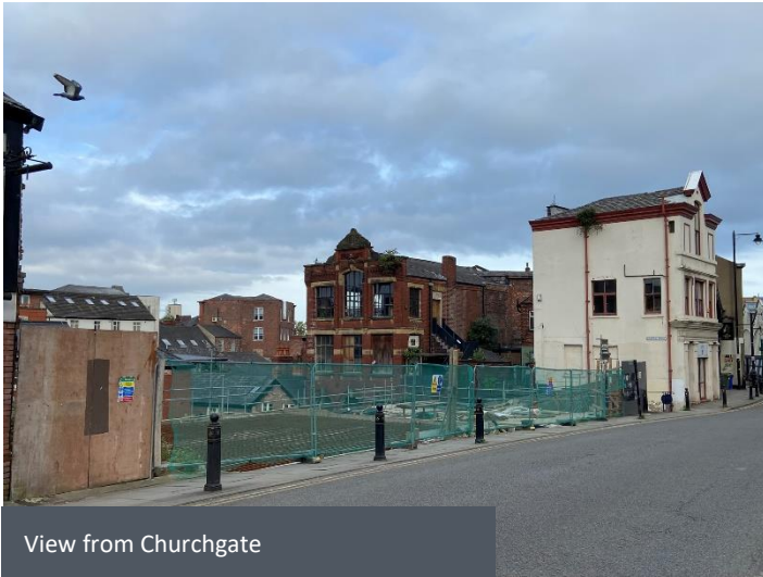
View from Churchgate