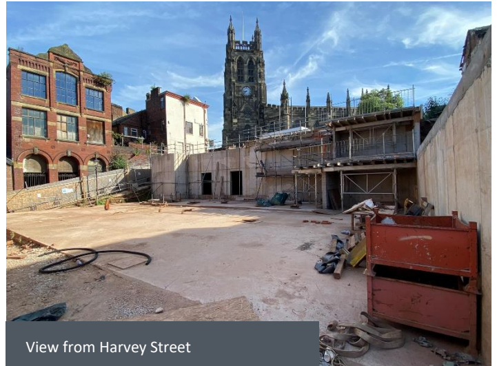
View from Harvey Street