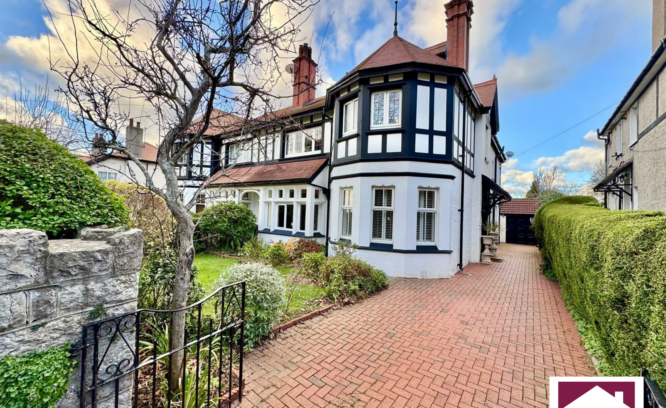
East Clyne Fferm Bach Road Llandudno LL30 1UA