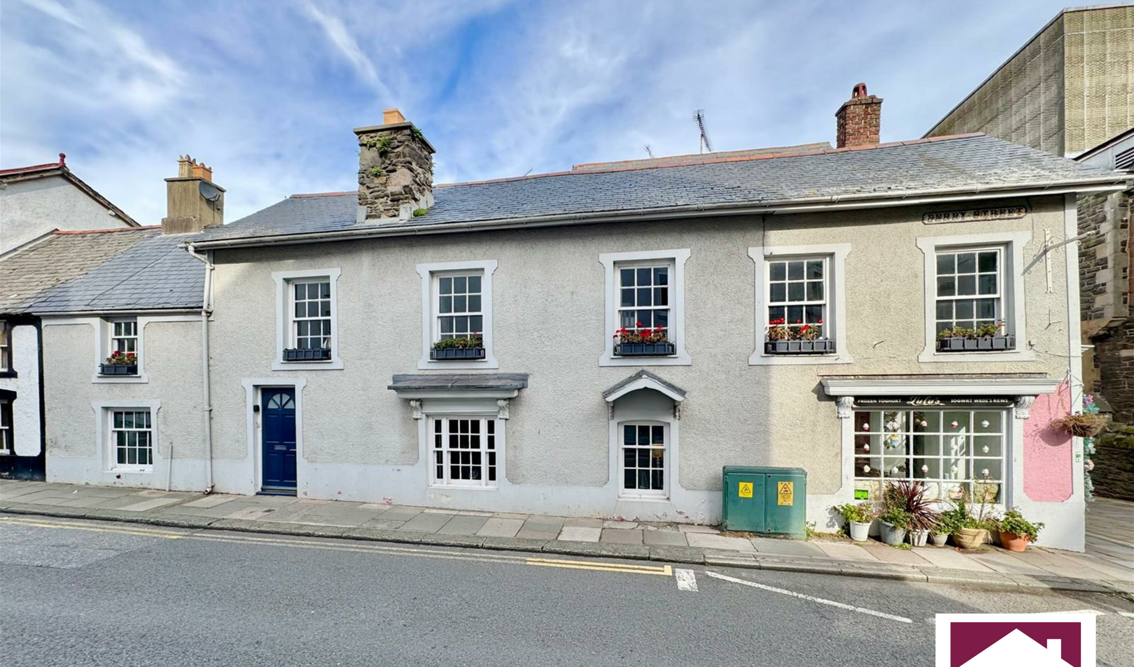
Sea Chest House, Conwy LL32 8DG