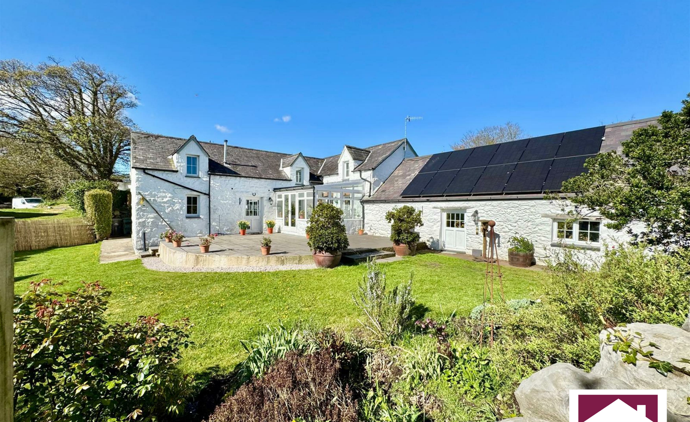
Garthmor Barn, Tyn Y Groes LL32 8TH