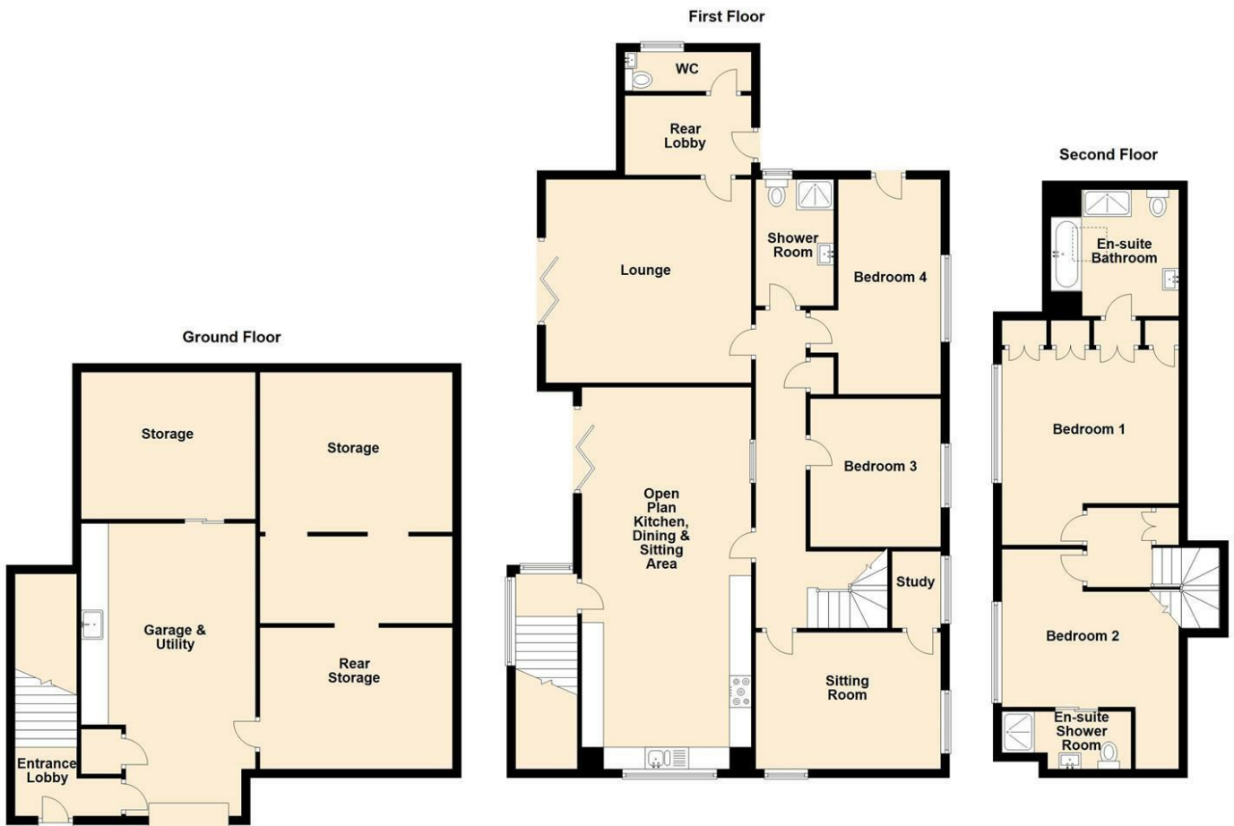
Floorplans are for identification purposes only and not to scale. Where measurements are shown, these are approximate and should not be relied on. Sanitary ware and kitchen fittings are representative only and approximate to actual shape, position and style. No liability is accepted in respect of any consequential loss arising from the use of this plan. Reproduced under licence from William Morris Energy Assessments. All rights reserved. Plan produced using PlanUp.

These particulars are intended only as a guide to prospective Purchasers to enable them to decide whether enquiries with a view to taking up negotiations but they are otherwise not intended to be relied upon in any way of for any purpose whatever and accordingly neither their accuracy nor the continued availability of the property is in any way guaranteed and they are furnished on the express understanding that neither the Agents nor the Vendor are to become under any liability or claim in respect of their contents. The Vendor does not hereby make or give or do the Agents nor does the Partner of the Employee of the Agents have any authority as regards the property of otherwise. Any prospective Purchaser or Lessee or other person in any way interested in the property should satisfy himself by inspection or otherwise as to the correctness of each statement contained in these Particulars. In the event of the Agent supplying any further information or expressing any opinion to a prospective Purchaser, whether oral or in writing, such information or expression of option must be treated as given on the same basis as these particulars.