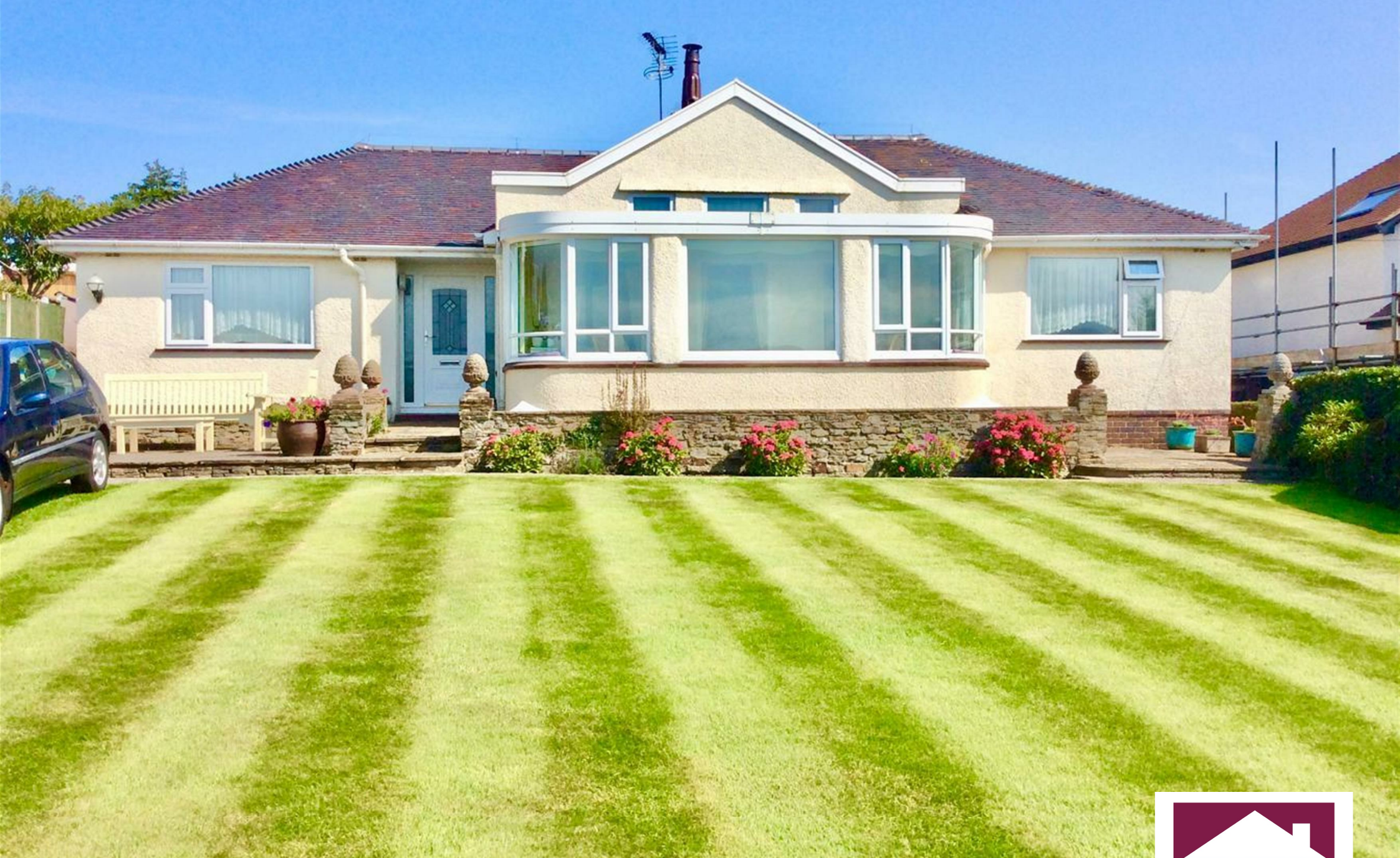
Fairwinds, 10 Overlea Crescent Deganwy LL31 9TB