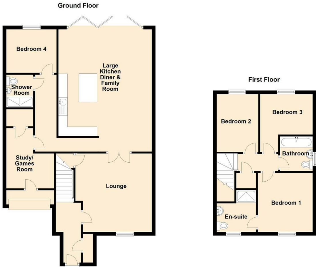
Floorplans are for identification purposes only and not to scale. Where measurements are shown, these are approximate and should not be relied on. Sanitary ware and kitchen fittings are representative only and approximate to actual shape, position and style. No liability is accepted in respect of any consequential loss arising from the use of this plan. Reproduced under licence from William Morris Energy Assessments. All rights reserved. Plan produced using PlanUp.

These particulars are intended only as a guide to prospective Purchasers to enable them to decide whether enquiries with a view to taking up negotiations but they are otherwise not intended to be relied upon in any way of for any purpose whatever and accordingly neither their accuracy nor the continued availability of the property is in any way guaranteed and they are furnished on the express understanding that neither the Agents nor the Vendor are to become under any liability or claim in respect of their contents. The Vendor does not hereby make or give or do the Agents nor does the Partner of the Employee of the Agents have any authority as regards the property of otherwise. Any prospective Purchaser or Lessee or other person in any way interested in the property should satisfy himself by inspection or otherwise as to the correctness of each statement contained in these Particulars. In the event of the Agent supplying any further information or expressing any opinion to a prospective Purchaser, whether oral or in writing, such information or expression of opinion must be treated as given on the same basis as these particulars.