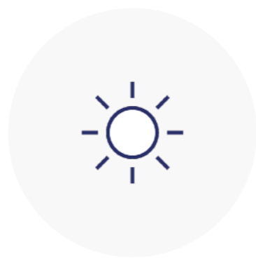
Excellent Natural Light