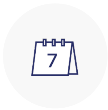
7 Day Trade