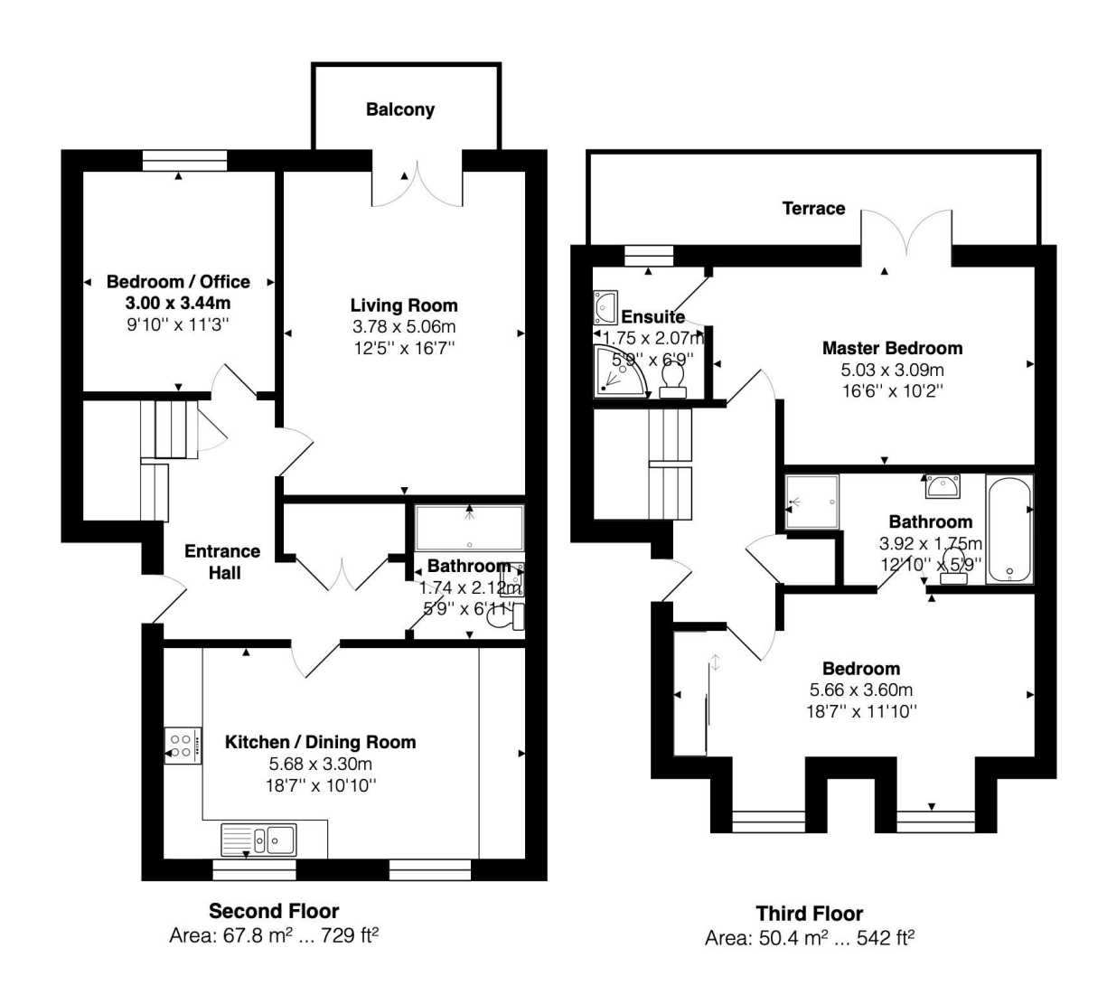
Total Area: 118.2 m<sup>2</sup> ... 1272 ft<sup>2</sup> (excluding balcony)