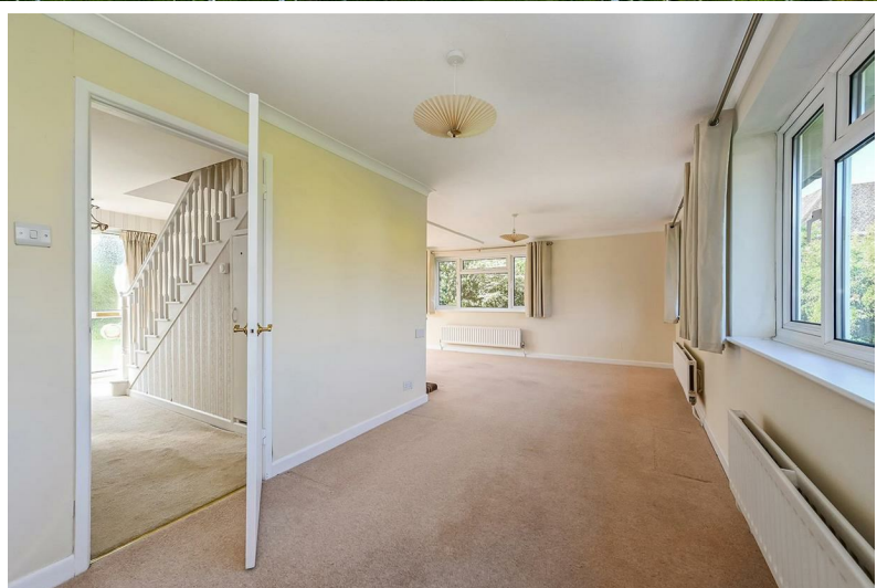
The Willows , Longparish, Andover, SP11 6PQ Guide Price £650,000