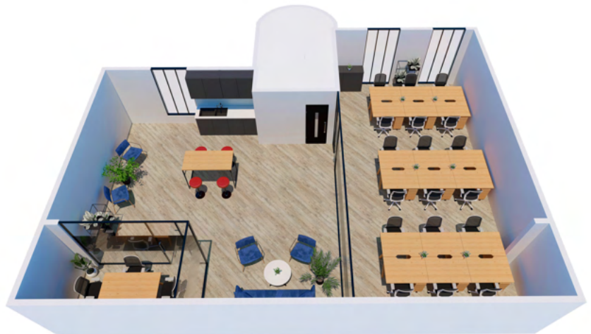
Third floor fit out