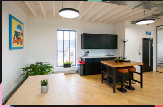
Breakout & Kitchen