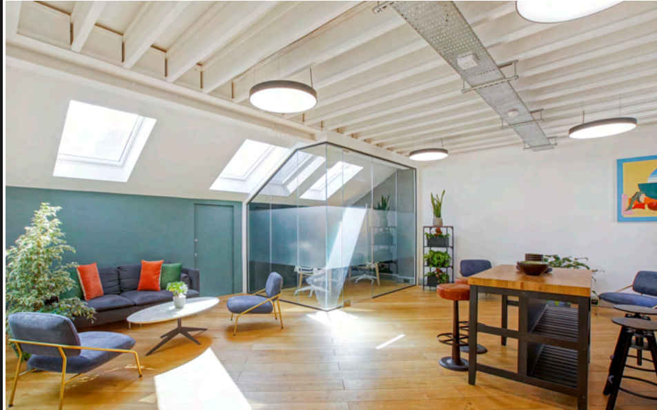
Third Floor photos