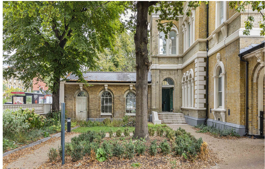
The John Denham Building, St Clements Hospital, Mile End Road, London, E3 4LH