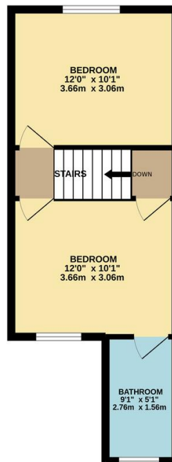
FLOORPLAN BY PHILLIPS GEORGE ESTATE AGENTS