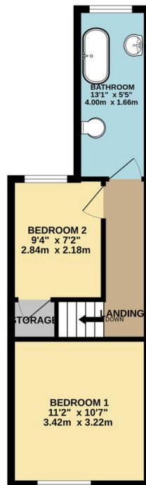
TOTAL FLOOR AREA : 660 sq.ft. (61.3 sq.m.) approx.

Whilst every attempt has been made to ensure the accuracy of the floorplan contained here, measurements of doors, windows, rooms and any other items are approximate and no responsibility is taken for any error, omission or mis-statement. This plan is for illustrative purposes only and should be used as such by any prospective purchaser. The services, systems and appliances shown have not been tested and no guarantee as to their operability or efficiency can be given. Made with Metaphor ©2025