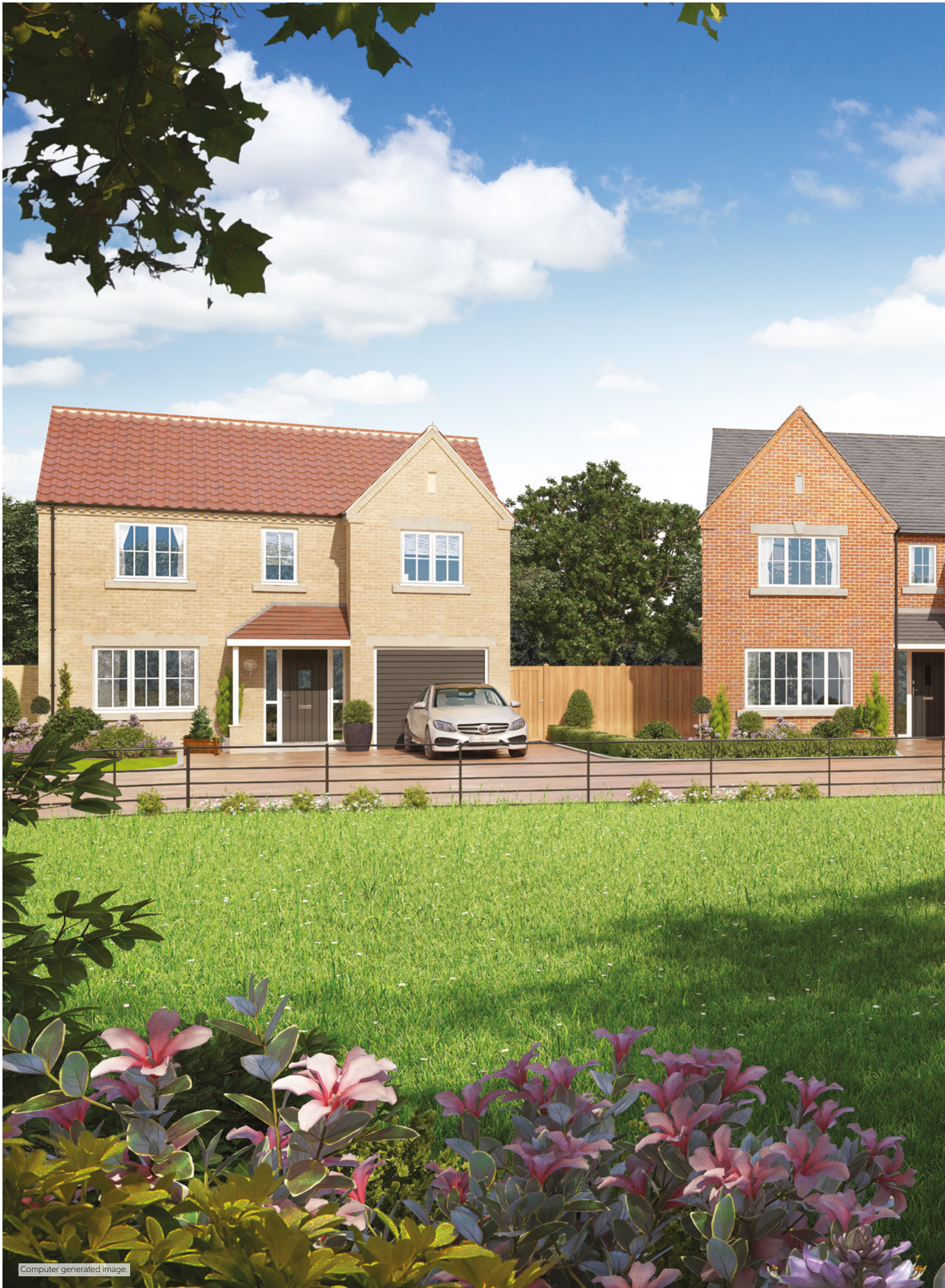
Computer generated image.