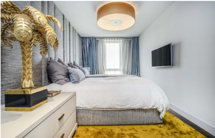
Avantgarde Place, E1