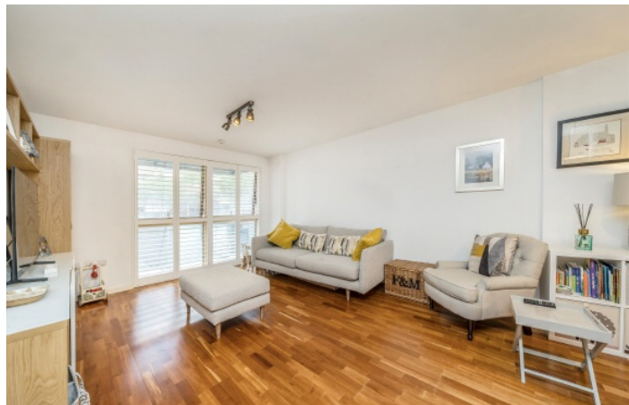
Poole Street, N1