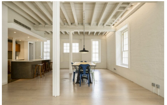
New Street, EC2M