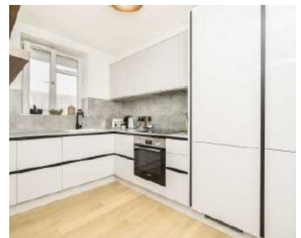
Chart Street, N1 £500,000

A two double bedroom lateral apartment situated on the second floor of a secure development close to Old Street Station. The property comprises of a generous living space with feature fireplace, a modern eat-in kitchen, two double bedrooms and a modern bathroom with a separate WC.